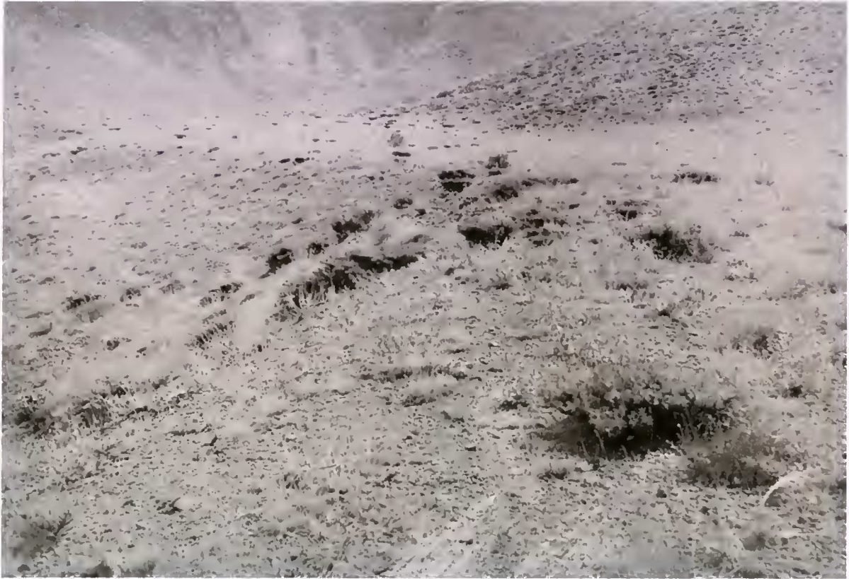
Figure 5. Habitat and type locality of Eremias (Eremias) montanus . 60 km northeast of Kermanshah, vicinity of Siah-Darreh village, Kermanshah Province, Western Iran.

Etymology: Eremias montanus is so named as it is apparently restricted in distribution to the upland and mountainous steppes of northeastern regions of Kermanshah province, western Iran.